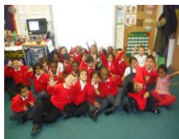
Smiling makes us happy!