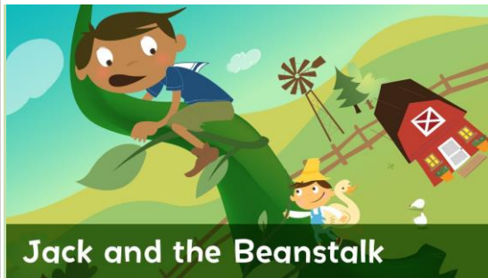
Jack and the Beanstalk

This week for literacy we will be encouraging the children to predict outcomes, to think of alternative endings and to compare plots and the feelings of characters with their own experiences.